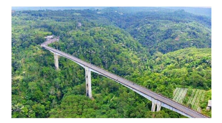
Figure 2. Tukad Bangkung Bridge, Pelaga Village

The natural condition of Pelaga Village is a fairly humid village, with an average temperature of 20 °C to 30 °C, with an average rainfall of 1,471 cm per year. The topography of the area is hilly with a slope of 62°. Therefore, agricultural land is generally made up of terraces in the form of terraces [25], [26]. In the population of Pelaga Village in 2016, the male population is 3,043 while the female population is 3,004 people. The population of Pelaga Village who graduated from elementary school was 70 people, 9 people graduated from junior high school, 180 people graduated from high school/vocational school, 22 people graduated with a diploma, and 90 people graduated with a bachelor's degree. Meanwhile, 515 people do not go to school and 2,330 people have not finished elementary school [27], [28].